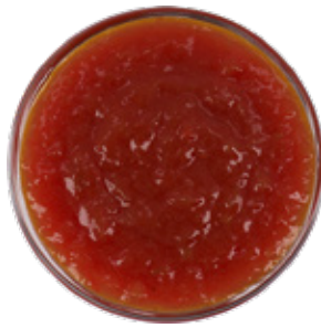
TOMATO MINCED RELISH