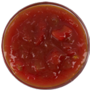
TOMATO CHUNKY RELISH