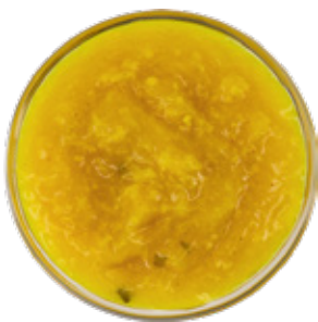
CHOW CHOW SAUCE